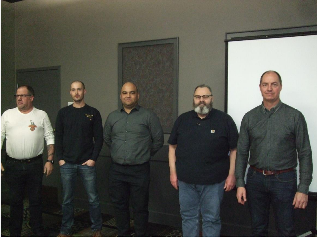
Contractors: Aluminum & Glass Worx, All Reach Glass, Alberta Glass, Capilano Glass, Creative Glass.